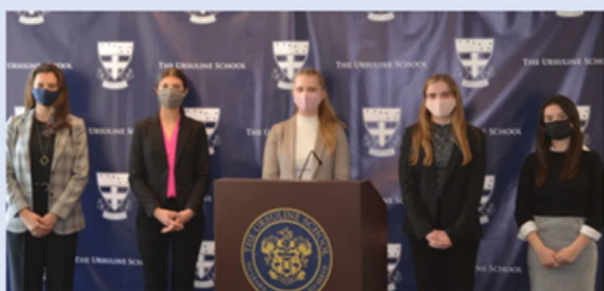
Class of 2021 Global Scholars Ursuline School New Rochelle, NY

The Global Scholars Certificate inspires and validates excellent global education learning opportunities, encourages students to enroll in courses and participate in activities with a global focus, and prepares globally competent students to be competitive in international careers. This distinction will reward those students who are willing to stretch beyond traditional requirements in order to set themselves apart in the international arena.