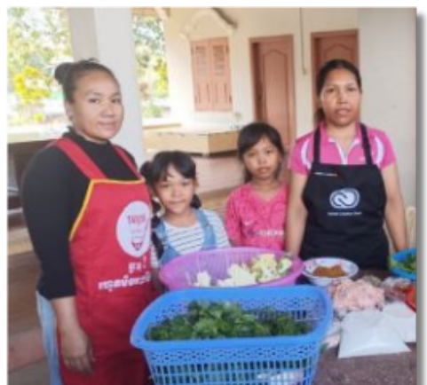
Some of the Community Kitchen participants