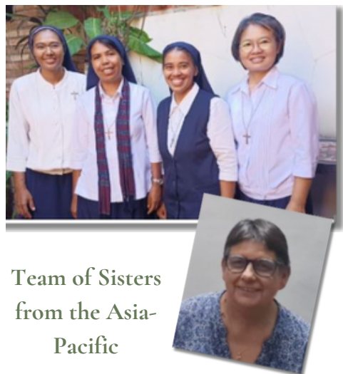
Team of Sisters from the Asia- Pacific