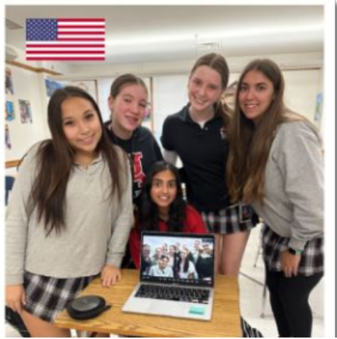
Planning zoom between US and Australian students