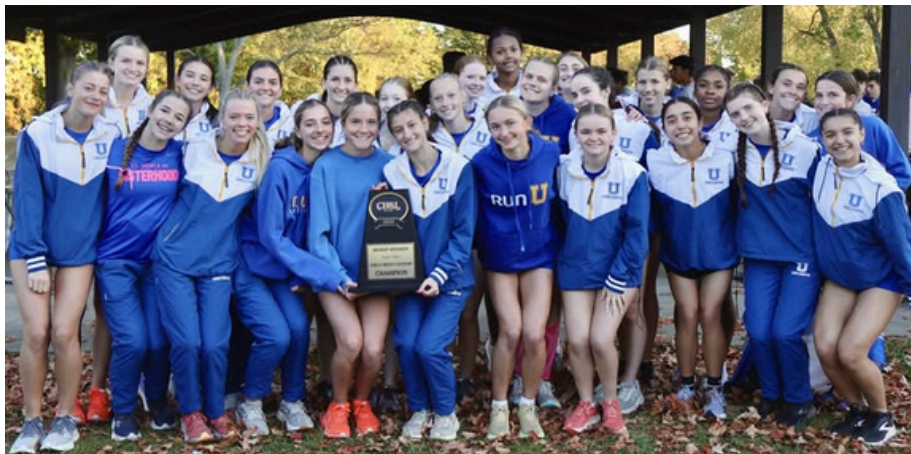
St. Louis hosting Ursuline Academy Dedham, MA and Ursuline Academy of New Orleans, LA

Congratulations to the JV and Varsity Cross Country teams of St. Ursula Academy Toledo, OH for winning the Ohio Catholic High School League Championship on October 7! #goarrows!